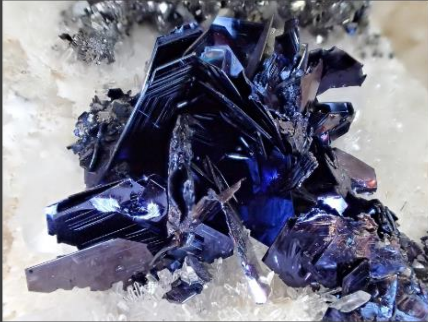
Covellite ( \text{CuS} ) from the Butte mining district, Montana.