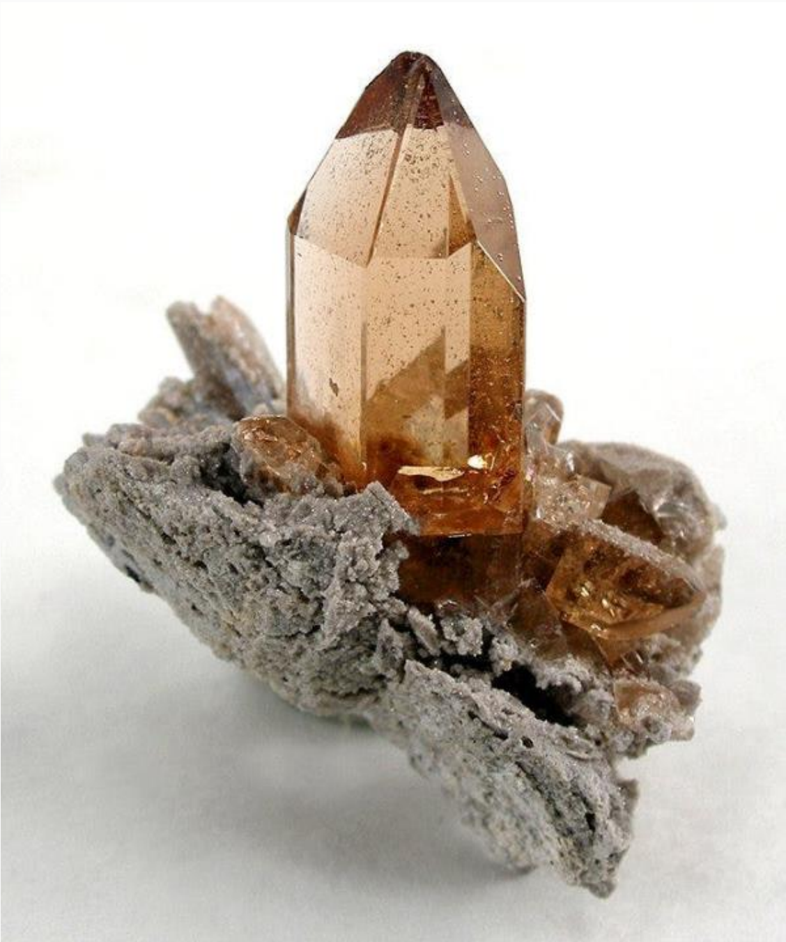
Topaz crystal (3.7 cm tall), Maynard Claims, near Bixby, Thomas Range, Utah.

Unheated citrine is mined in the northern Ural Mountains of Russia but other important occurrences are in Bolivia, Spain, Madagascar, Mexico, and Uruguay; most citrine (heat-