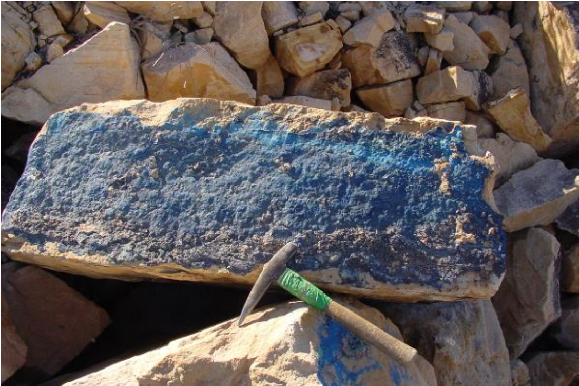
Block of sandstone with an azurite coating that formed as a replacement of copper sulfide minerals in a vein, Lisbon Valley copper mine.