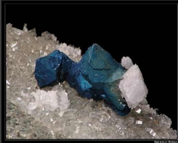
Bornite ( \text{Cu}_5\text{FeS}_4 ) from the Dzhezkazgan mining district, Karaganda region, Kazakhstan.